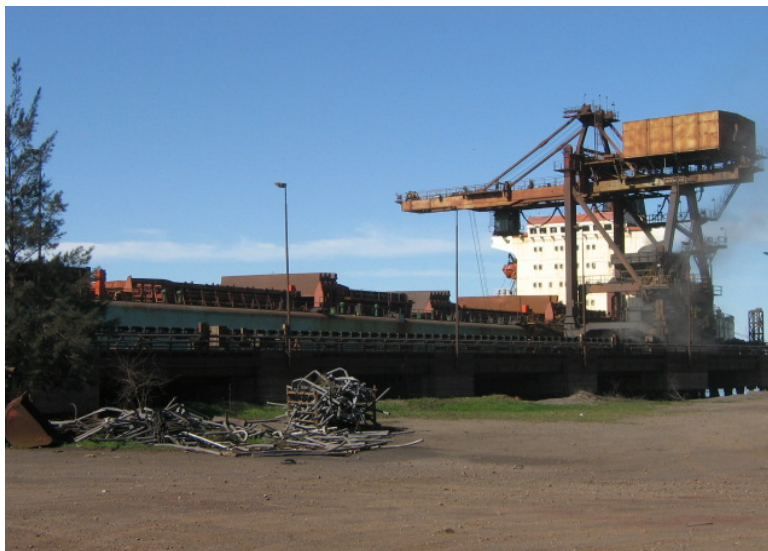
Acindar Mineral Wharf