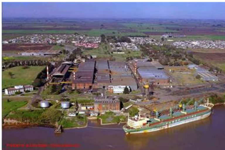
Acindar Commercial Wharf