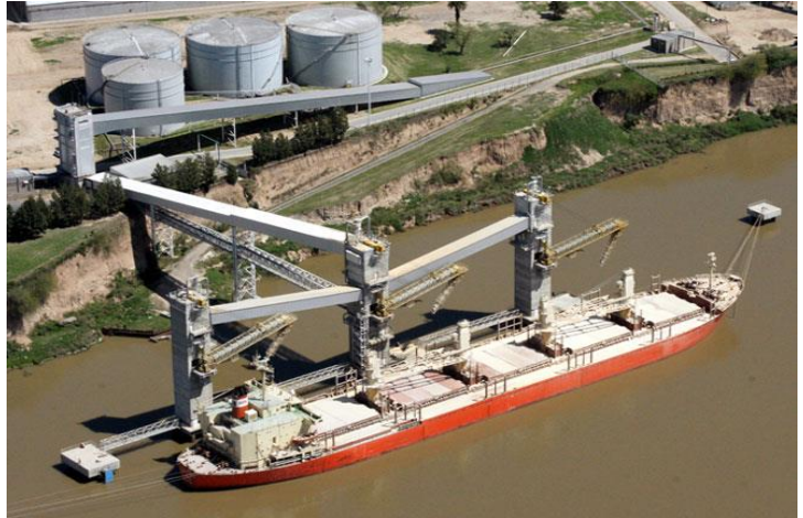
LDC - Dreyfus Timbues