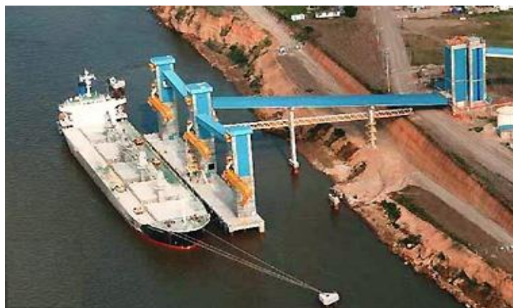
Noble S.A. - Noble Timbues