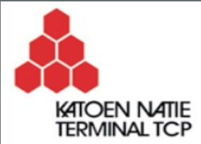
Terminal Cuenca del Plata